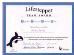
"Whale Done" Certificates