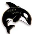
"Whale Done" Pins