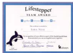
"Whale Done" Certificates