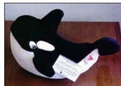
Traveling Team Whale Migrates around to each winning team for display